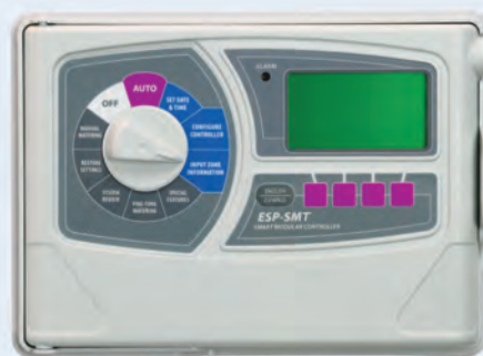
Weather-based irrigation controller

There are two primary technologies employed by WBICs: onsite sensor-based control and signal-based control. Onsite sensor-based controllers use real-time measurements of locally measured factors (e.g., temperature, humidity, solar radiation) to adjust irrigation scheduling. An onsite sensor-based system may have historic weather information for the site programmed into memory, which it can use to modify the expected irrigation requirement for the day or calculate onsite evapotranspiration (ET) for the landscape. In contrast, signal-based controllers receive a regular signal of prevailing weather conditions via radio, telephone, cable, cellular, Web, or pager technology. The signal typically uses data from local weather station(s) to update the current schedule for the controller.